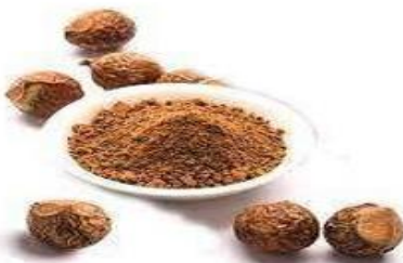
Figure 4: Ritha powder.