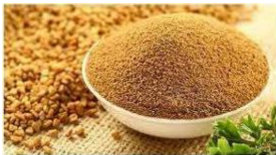
Figure 10: Fenugreek powder.