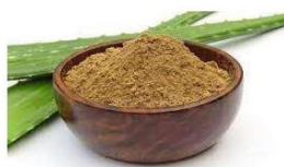
Figure 3: Aloe vera powder.