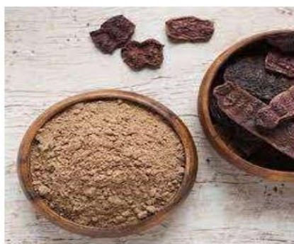
Figure 5: Shikakai powder.