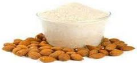
Figure 6: Badam powder.