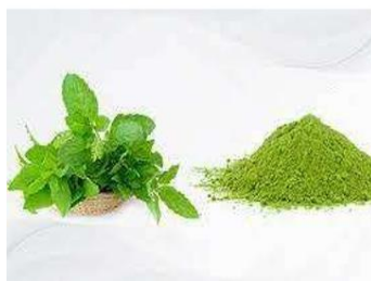
Figure 2: Tulsi powder.