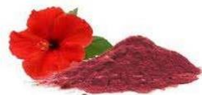
Figure 9: Hibiscus plant.