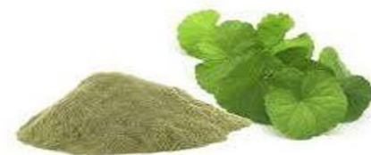
Figure 8: Bramhi powder.