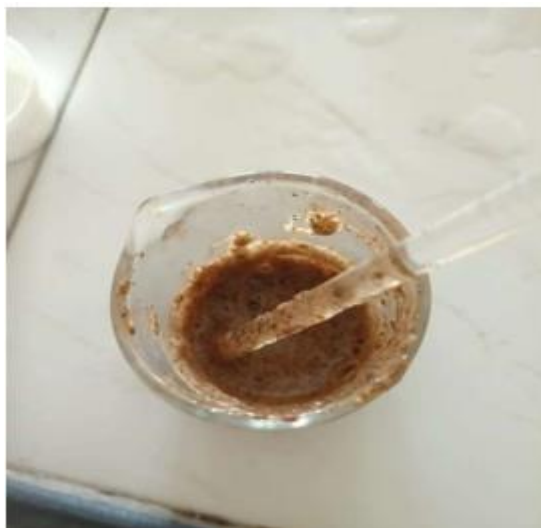
Figure 11: Shampoo after preparation.