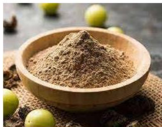
Figure 7: Amla powder.