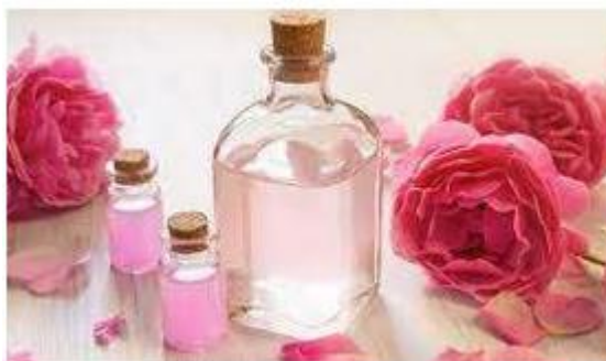
Figure 11: Rose water.